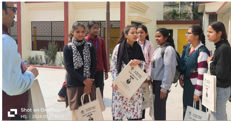
बहुउद्देशीय सभागार AUDITORIUM